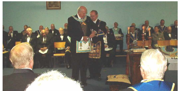
The Grand Master investing the Worshipful Master with his new regalia.