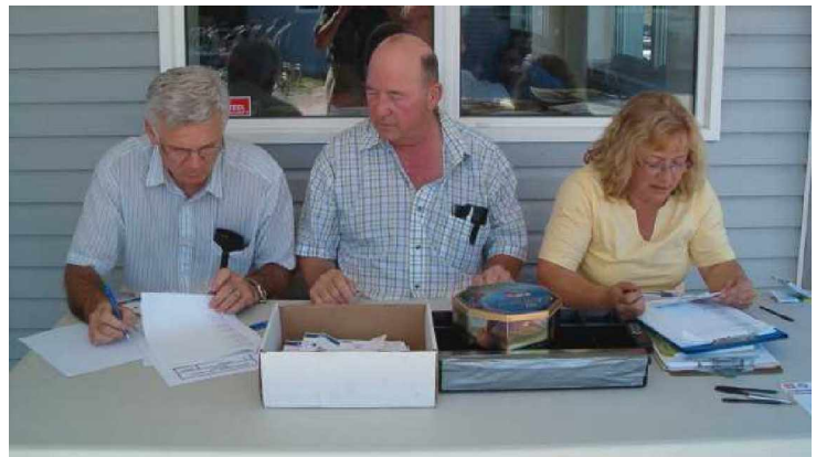
Making sure everyone starts on time