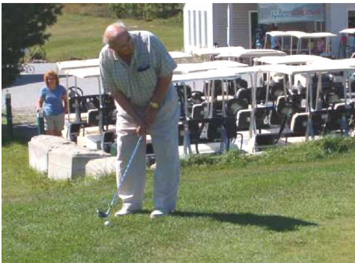
Chipping for a Bird. Who needs Tiger now?